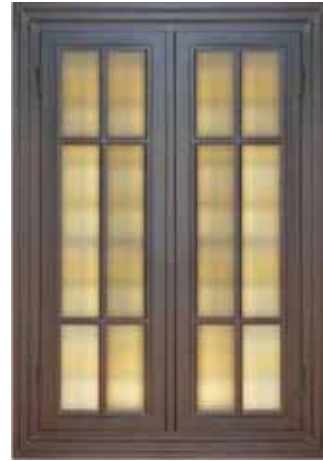
2 Panel (Check)