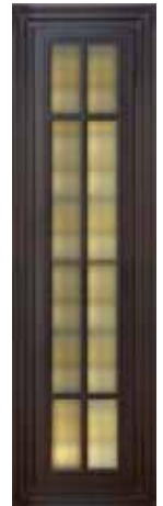
1 Panel French (Check)