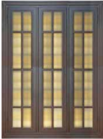
3 Panel French (Check)