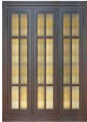
3 Panel Check