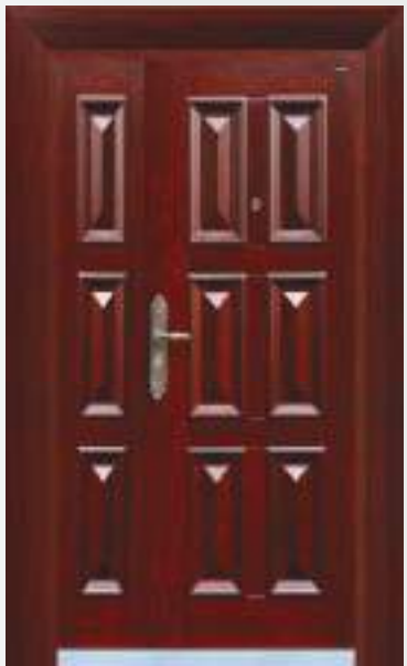
IL GL SM 17