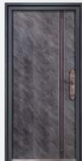
IL Gi 1614