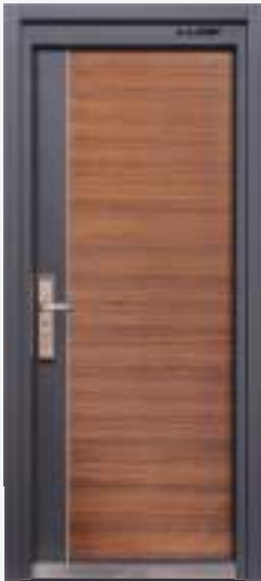
IL GL XY 6