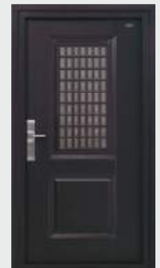
IL Gi 818 E