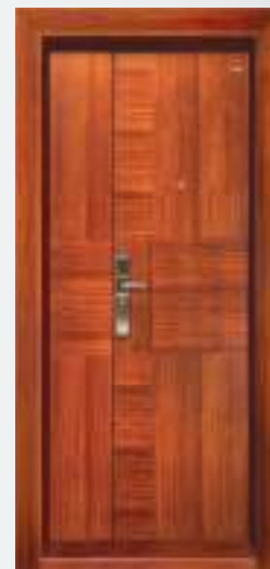
IL Gi PA