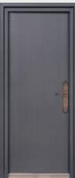
IL GL XH 3