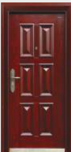
IL GL 17