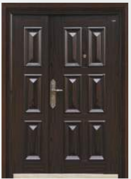
IL GL SM 17 E