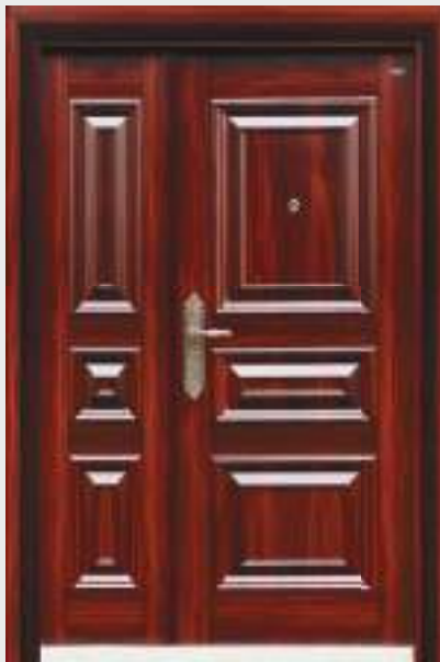
IL GL SM 20