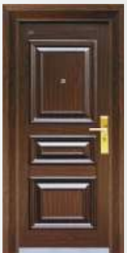
IL GL 20 E