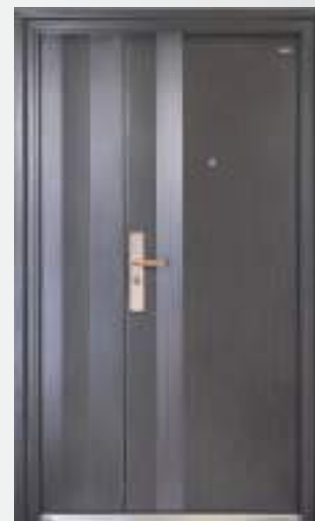
IL Gi SM AS03 E