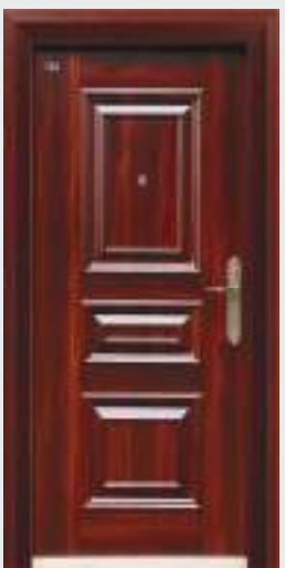
IL GL 20