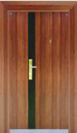
IL GL SM JP 02